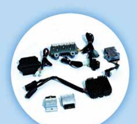
REGULATOR & RECTIFIER UNIT